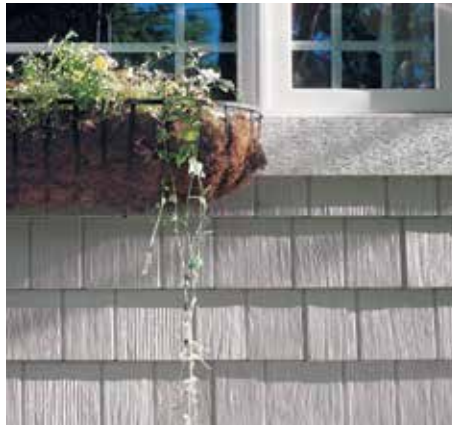
Aside Premium Shakes – the classic look of deep-grained cedar shakes.