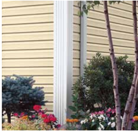
Trimworks 7" fluted corner post.