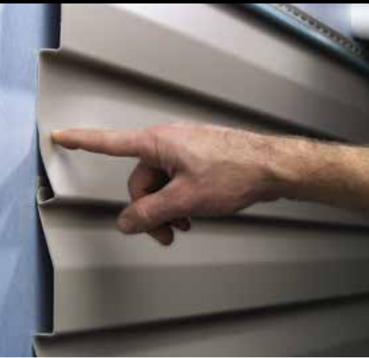
Traditional siding yields a hollow void between the siding and the wall.