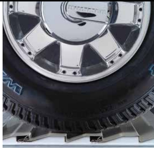
Contoured insulation gives Charter Oak Energy Elite additional support and increased durability.