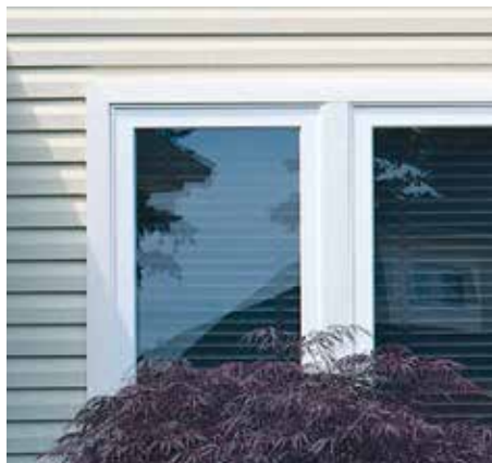
Charter Oak dutch lap with Trimworks 3-1/2" window trim.