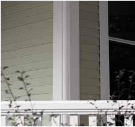
Trimworks® three-piece beaded corner post.

Aside offers a wide selection of trim and accent products made to complement the beauty and colors of Charter Oak Energy Elite siding.