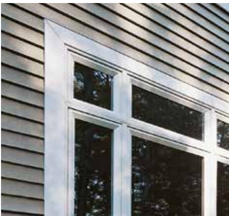
Charter Oak clapboard with Trimworks 5" window trim.