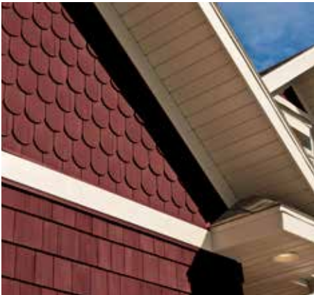
Aside Premium Scallops – Victorian-inspired half-round shingles.