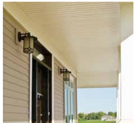
Charter Oak soffit easily spans long runs without sagging.