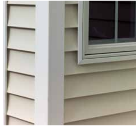
Trimworks traditional corner post.