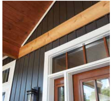
Board & Batten vertical siding accentuates gables and other areas.