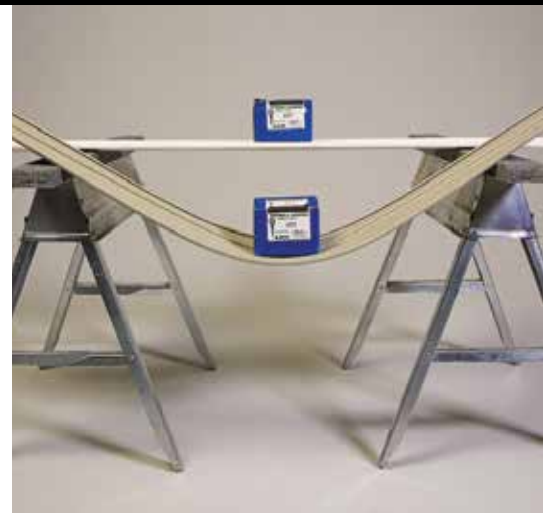
In strictly controlled laboratory comparisons, Charter Oak remained rigid, while the competition sagged.

CHARTER OAK ENERGY ELITE IS AN INVESTMENT that really pays dividends. Energy savings and freedom from maintenance are benefits you'll enjoy year after year, as well as two desirable amenities that can add value to your home and will always be a pleasure to live with.