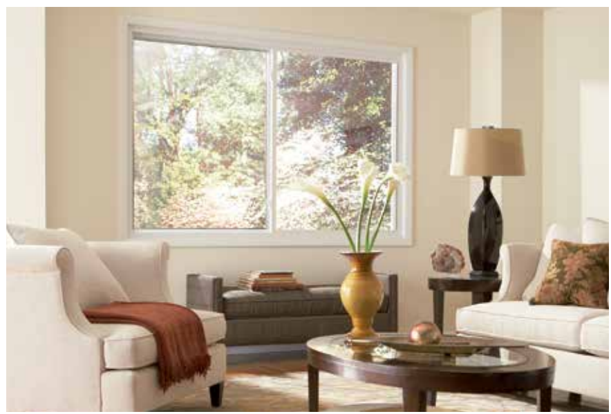
Above Top: Fusion Double-Hung Windows feature a constant force balance system to ensure smooth operation; both sashes tilt in for convenient cleaning from inside your home. Above: Fusion Sliding Windows glide horizontally on a nylon-encased dual brass roller system, and the sashes lift out for easy cleaning.<sup>2</sup>