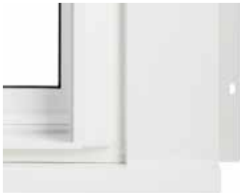
NC | 3.5" Casing with Bullnose Sill