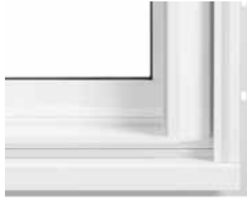
NC | Flushmount Brickmould with Bullnose Sill (Masonry)