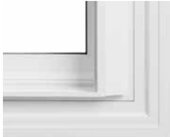
RM | 1.5" Brickmould (Siding Removal)