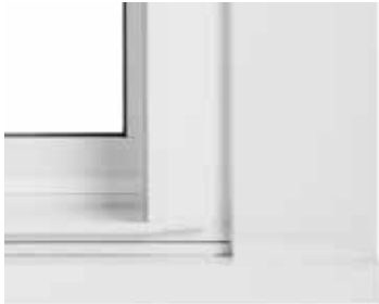
RM | 3.5" Casing with Bullnose Sill (Siding Removal)