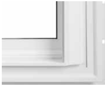
NC | 3/4" Brickmould

RM = Replacement Market NC = New Construction/Home Addition Market