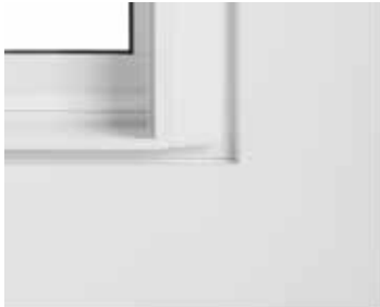
RM | 3.5" Casing 4-Sided (Siding Cutback)

This system features four distinct designs that utilize six installation applications to enhance a home's exterior.