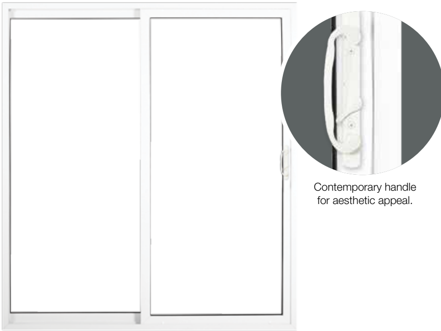
Contemporary handle for aesthetic appeal.

The New Construction Sliding Patio Door offers a great solution for not only contemporary or traditional architecture, but also for residential, multi-family or light commercial installations. The sleek lines of this patio door, surrounded by an appealing beveled mainframe, make this a wise choice for beauty, maintenance-freedom and energy efficiency.