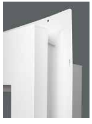
1900 Series Double-Hung with Nailing Fin (shown with optional 3.5" flat casing)