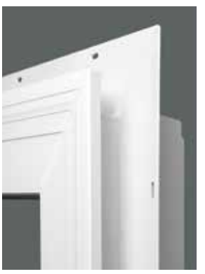
1900 Series Single-Hung with Nailing Fin and Integral Brickmould J-Channel