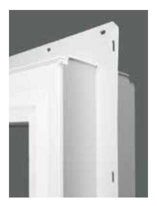
1700 Series Single-Hung with Nailing Fin

Multiple framing options streamline installation for every type of construction, cladding, and masonry type with dependable jobsite delivery options to improve the contractor and builder experience with today's design trends in mind.