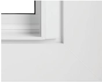
RM | 3-1/2" Casing 4-Sided (Siding Cutback)

Choose from four distinct designs that utilize six installation applications to enhance a home's exterior.