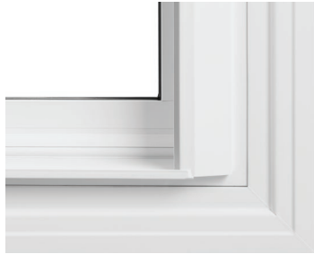
RM | 1-1/2" Brickmould (Siding Removal)