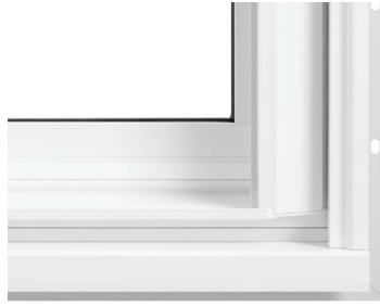
NC | Flushmount Brickmould with Bullnose Sill (Masonry)