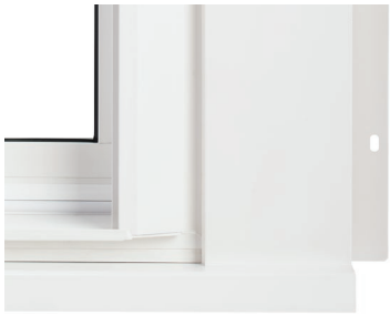
NC | 3-1/2" Casing with Bullnose Sill