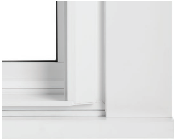
RM | 3-1/2" Casing with Bullnose Sill (Siding Removal)