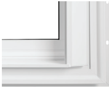
NC | 3/4" Brickmould

RM = Replacement Market NC = New Construction/Home Addition Market