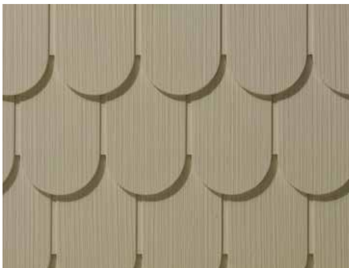
Pelican Bay One Scallops create the distinctive look and roughsawn feel of cedar half-rounds.

Pelican Bay One Traditional Shakes will appeal to your home's structural sensibility and enhance the overall curb appeal at the same time. A single 7" exposure and authentic woodgrain reproduction, created with the use of multiple random molds, offer a distinguished and elegant profile that looks remarkably realistic. A longer length (6'8") combined with innovative installation technology creates a beautiful, seamless appearance. Sharp woodgrain details add natural highlights and shading to form a timeless warmth and beauty for your home's exterior.