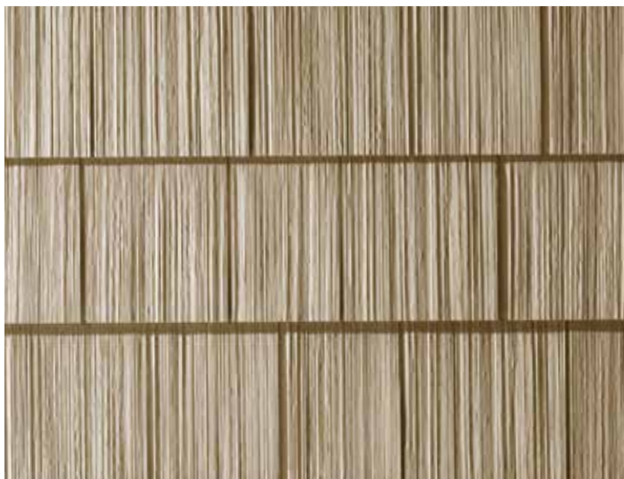
Traditional 7" shake features a remarkably authentic woodgrain texture.

There are no limits to what you can do when you imagine your perfect exterior design. From ornate and dramatic to muted and charming, customization is yours with Pelican Bay One Shakes and Scallops. Beautiful, practical and made to last, this impressive collection features the distinctive beauty of natural-looking woodgrains without the time-consuming maintenance and costly upkeep.